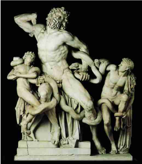
Hellenistic masterpiece or Michelangelo forgery?